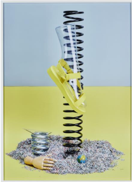
ANNETTE KELM, Shredded Money, 2019