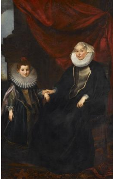
PETER PAUL RUBENS, Old Lady with Young Girl, ca. 1605 / 06