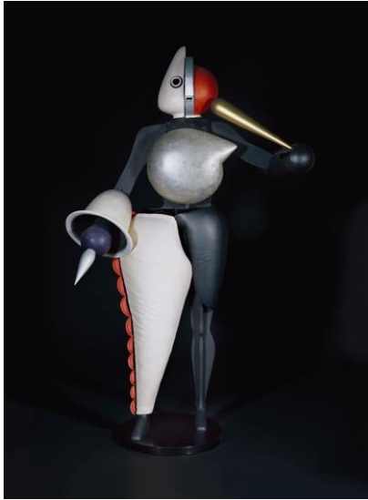
OSKAR SCHLEMMER, The Triadic Ballet: The Abstract, 1922, Staatsgalerie Stuttgart